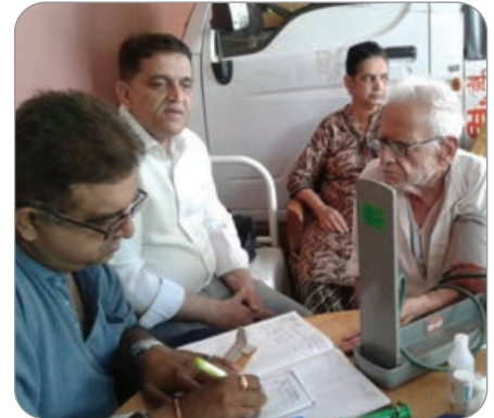
Health check-up at Ma Kankeshwari