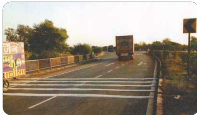
Road safety through painting pedestrian crossing