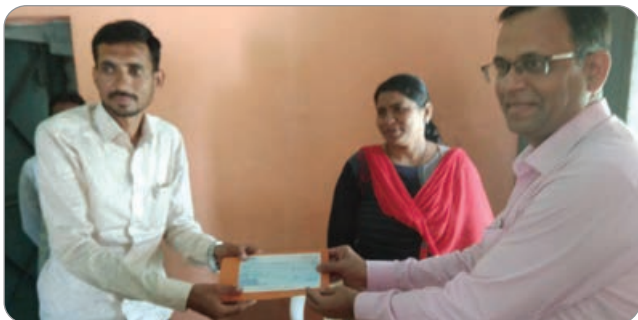
Assistance to purchase water tank in the village

In March 2018, an amount of ₹25,000/- was provided to Pipli village for purchase of a water tank through water and sanitation management organisation.