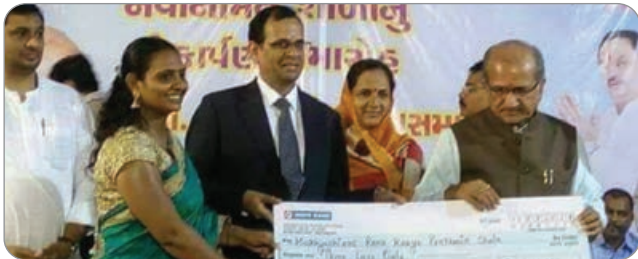
Financial aid given for school construction

Financial support amounting ₹3 lacs was extended in July 2017 and February 2018, for the construction of girls primary school in Ranu through government interventions. Also, furniture items like office table, cupboards, chairs, etc and other equipments were purchased for this cause.