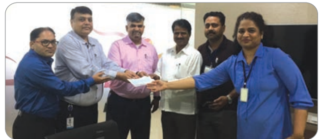
Purchased School Uniforms