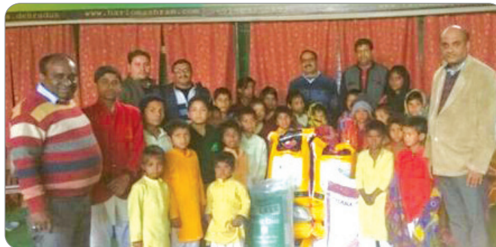
Grocery items provided to Hari Om Ashram

Ipca Dehradun provided assistance of ₹0.10 lacs on CSR activities to aid social causes. In the month of February 2018, the CSR team provided Hari Om Ashram with grocery items, thus supporting cause to improve health and eradicate poverty.