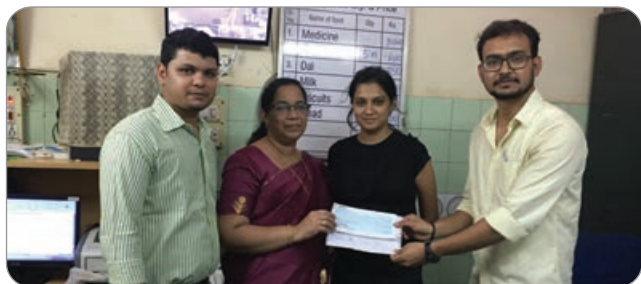
Ipca team at Ahimsa