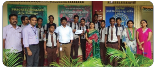
School Fees Assistance

Further in March 2018, an amount of ₹27,171/- was spent on purchase of school uniforms for children.