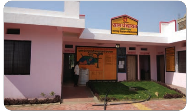
Infrastructure facility in Sejavta

Extended help of ₹16.50 lacs through Gram Vikas Samiti, Sejavta in May 2017, Sept 2017 and Feb 2018 in support of various activities organised by the NGO. One of the notable projects include the construction of Panchayat Bhavan. The Bhawan is being utilised for different social and cultural activities in the village. A first aid center is operating at the Bhavan and is handled by Ipca Ratlam.