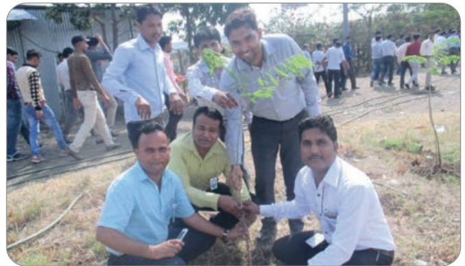
Tree plantation drive