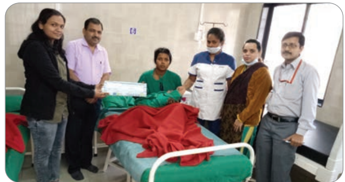
Distributed new born kits