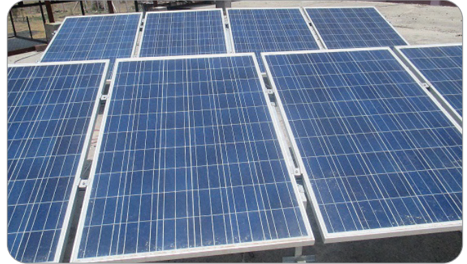
Solar panels installed in school