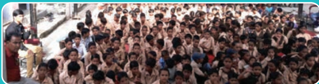
Infrastructure improvement for Vidhyala Vikas and Prabandhan Samiti