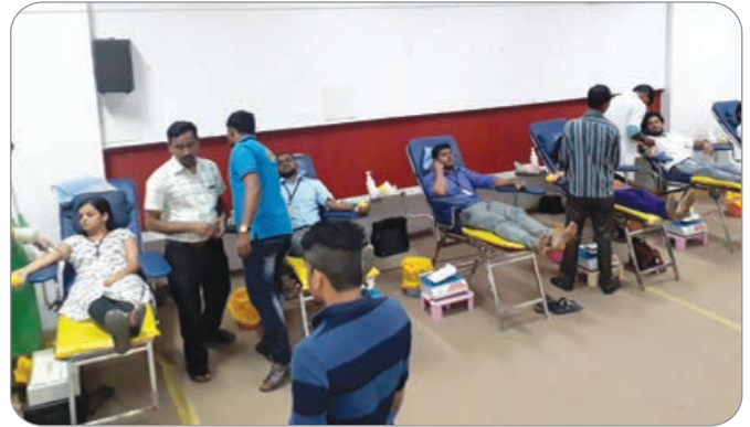
Blood donation - Mumbai

Ipca Silvassa collected 47 units of blood in December 2017