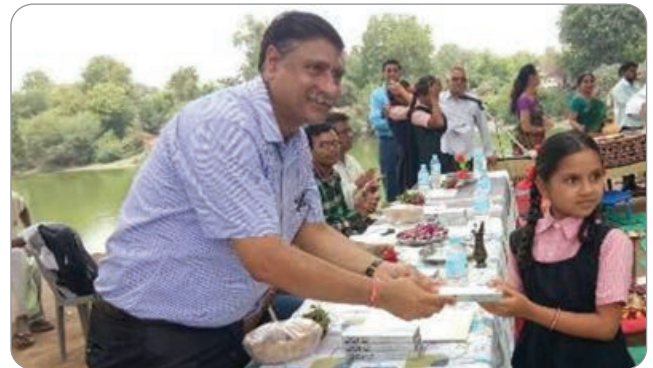
Girl child education

Stationary and school items like bags, tiffin, compass boxes etc, were given to students amounting ₹17,200/- in June 2017, to promote girl child education. Also, at a primary girls school, ID cards amounting ₹9,450 were distributed among students in October 2017.