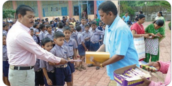
Distribution of stationery items