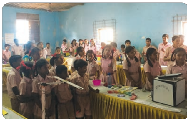
Dnyaneshwar Vidya Mandir