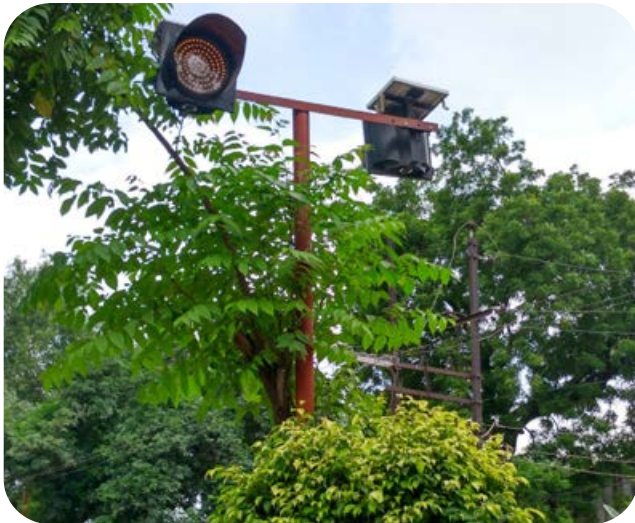
Installed traffic lights on street