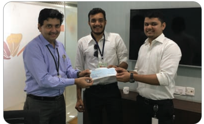
Financial Assistance to Child Help Foundation