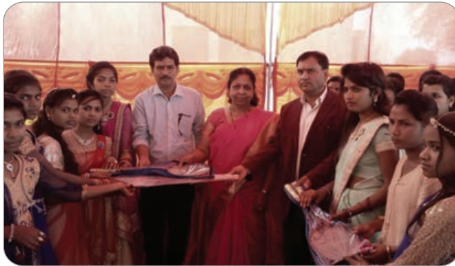
Govt. School, Ghatla

Encouraged sports activities by offering sports kits and equipments and promoting tournaments to uplift sportsman spirit among young players. Financial aid amounting ₹1.64 lacs was shared on this development.