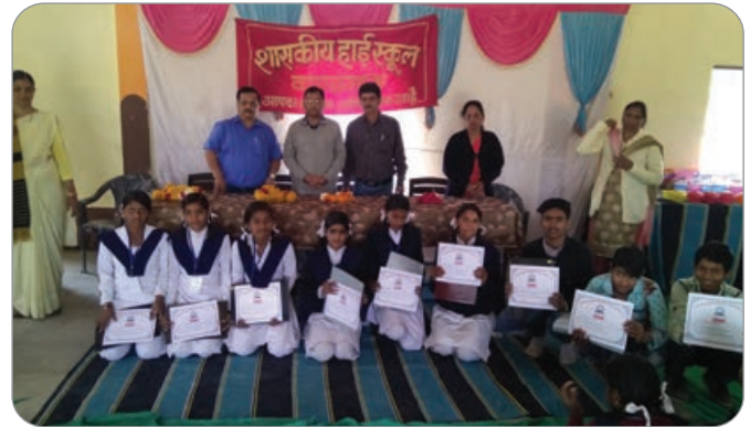
Govt. School, Kanderwasa