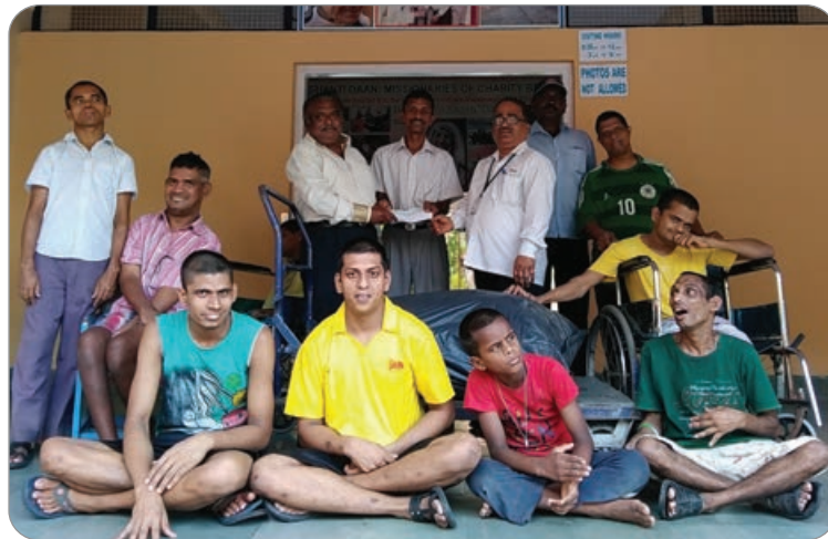
Shanti Daan Ashram